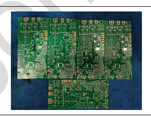
Fig.R01.2 After the test